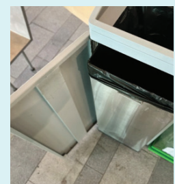
Hinged side door