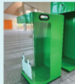
Transparent bin body