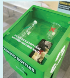
Clear top display