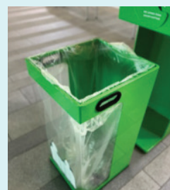
Removable bin receptacle